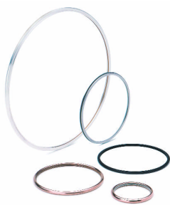
Metal sealing products

Parker's highly-engineered metal seal designs offer customized solutions for more demanding applications, where extreme temperature, corrosive media, high vacuum, near-zero leakage or long life concerns are present. As materials used in a resilient metal seal preclude effects of gaseous permeation, these seals provide exceptional performance in critical vacuum applications. Resilient metal seals are made-to-order for specific applications, and offered in many configurations, including: